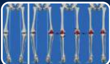
ALIGNMENT PRINCIPLES IN TKR