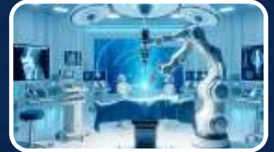
SESSIONS ON NEWER TRENDS & FUTURE IN ARTHROPLASTY