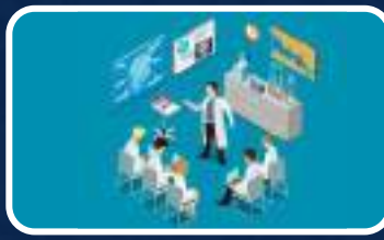
YOUNG SURGEONS FORUM