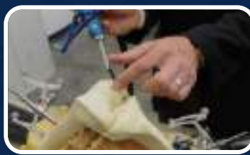
SAW BONE WORKSHOP ON UNI & REVISION TKA