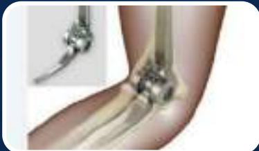
TOTAL ELBOW REPLACEMENT