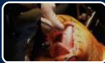
LIVE ROBOTICS IN TKR/UNI